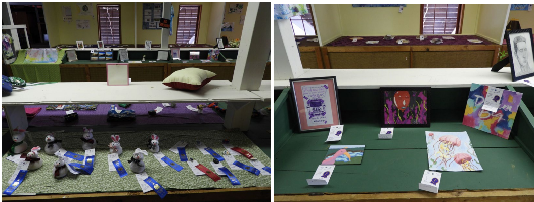
Exhibit Hall Classes will be divided as follows: (for age clarification see general rules)

Exhibits must remain until after the awards ceremony