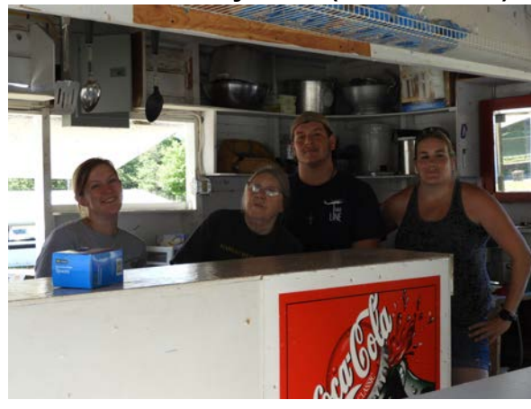
*The 4-H Food Booth proceeds to benefit the 4-H Misfits Club.