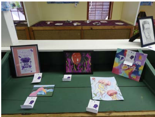
Exhibit Hall Classes will be divided as follows: (for age clarification see general rules)